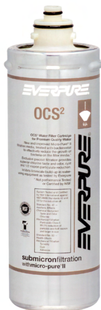
OCS 2 Replacement Cartridge: EV9618-02

Delivers premium quality water for office coffee applications