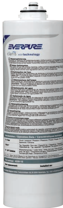
Claris Small Cartridge: EV4339-10

Adjustable ion-selective filters to tailor carbonate hardness levels in potable water