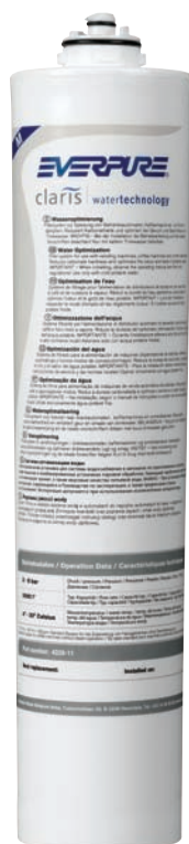
Claris Medium Cartridge: EV4339-11

Adjustable ion-selective filters to tailor carbonate hardness levels in potable water