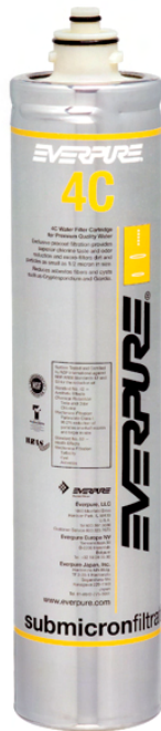
4C Replacement Cartridge: EV9600-00 (1-pack) EV9601-00 (6-pack)

Delivers premium quality water for cold cup vending applications