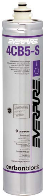
4CB5-S Replacement Cartridge: EV9617-21

Delivers quality water for foodservice, vending and OCS applications