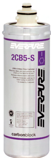
2CB5-S Replacement Cartridge: EV9617-22

Delivers quality water for foodservice, vending and OCS applications