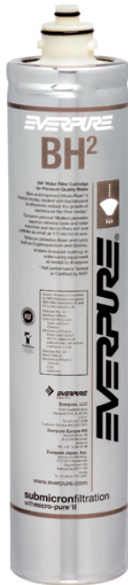
BH 2 Replacement Cartridge: EV9612-50

Delivers premium quality water for coffee applications